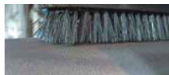
Electric Insulation Detection (EID)