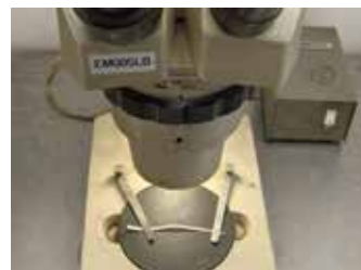
Dust and Debris Inspection