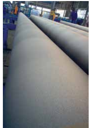
Shot Blasted Pipe

Once fully cooled, pipes are subjected to Electric Insulation Detection (EID) to check for pinholes before having the ends dressed and prepared.